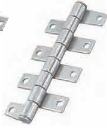
0419626 Long Leaves