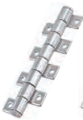
0419621 Short Leaves